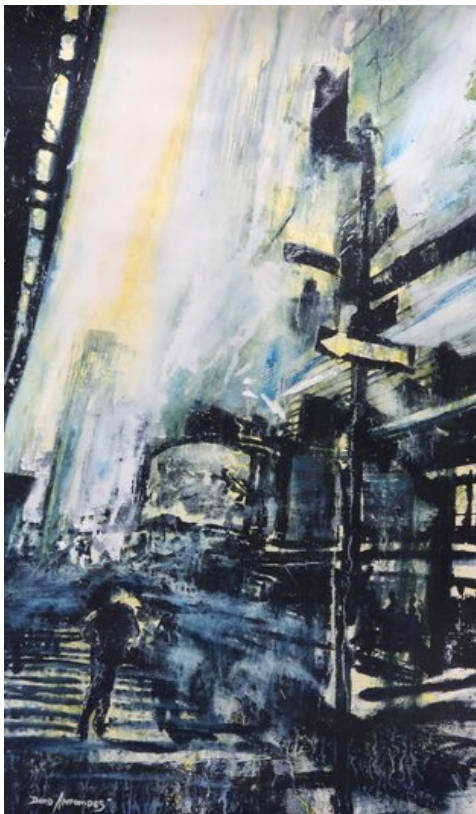
Worlds, Watercolour on Paper, 45.5 x 27 in.

The artist explains that his approach to abstract painting involves building up the composition with layers of pigment, then reducing and deconstructing details. In 59th St. N.Y. for example, the whooshing energy of a busy street is perceivable, but the tall buildings and clock tower are more imagined than substantial. The blue-gray shapes, which suggest exterior walls and windows, form a grid-like structure that holds in counterpoint the meteoric light cascading skyward into the ether. "I know this corner well," says the artist, "it's near the Students League and Central Park. I have often walked this area."