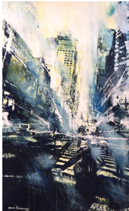
Parallel, Watercolour on Paper, 45.5 x 27 in.