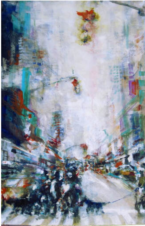
Glide, Watercolour on Paper, 36 x 23 in.