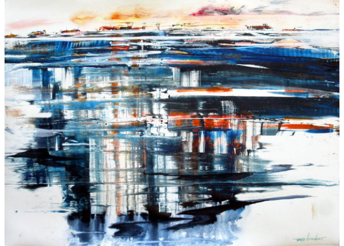
Harbour, Late-evening, mixed-media, 29.5 x 38 in.

Antonides is an experienced printmaker who makes his own inks. Harbour, Late Evening uses a variety of mediums and techniques to produce an evocative image of the BC coastline. He used a combination of oil-based inks on plexiglass and water-soluble pigments on paper to produce this atmospheric work. The scene was inspired by Vancouver's English Bay in the evening, explains the artist: "We see boats floating motionless on the horizon line, sunset orange reflected in the calm water, and perhaps a seal, moving elegantly through the bull kelp."