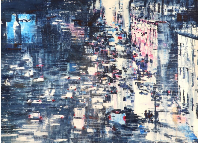
Day's Edge, Watercolour on Paper, 44.5 x 58.5 in.

The artist has extensive training in Asian brushwork and composition. Following the practice of lyrical abstraction painters like Chu Teh Chun, his markmaking varies from precise to expansive. In Parallel for example, expressive brushwork is used to blend in and scabble paint on the thick paper ground. In contrast, bright dashes of yellow, green and mauve are carefully placed accents. Like musical notes in a composition, these accents highlight and enliven the mood of the busy street. "A lyrical story is unfolding," says the artist, "told by the energetic placement of contrasting shapes - some moving, some still."