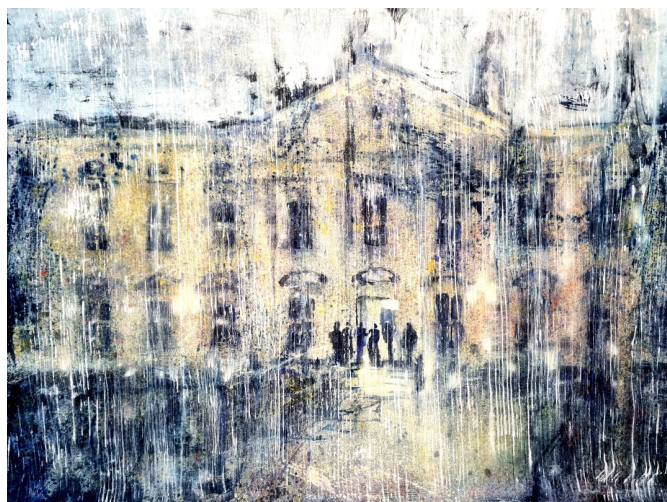
"Progressions and Conciliations, Arrival," Watercolour on Paper, 44 x 58 in. (Available)